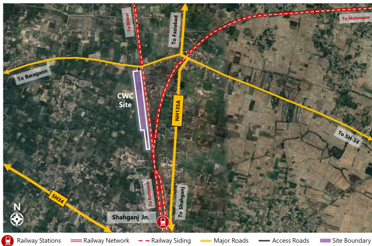
Figure : Shahganj Location Assessment - Micro level