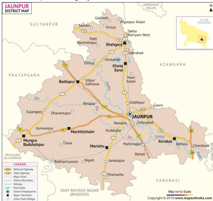
Figure: Map of Shahganj District

Jaunpur district falls in the Varanasi division of Uttar Pradesh. Jaunpur town serves as the district headquarters. The district has been divided into 6 Tehsils and 21 development Blocks. The district is bounded by the Sultanpur to its North, Azamgarh to North-East, Ghazipur to East, Varanasi to its South-East, Sant Kabir Nagar to the South, Allahabad to the South- West and Pratapgarh to the West. The district map of Shahganj District is shown below.