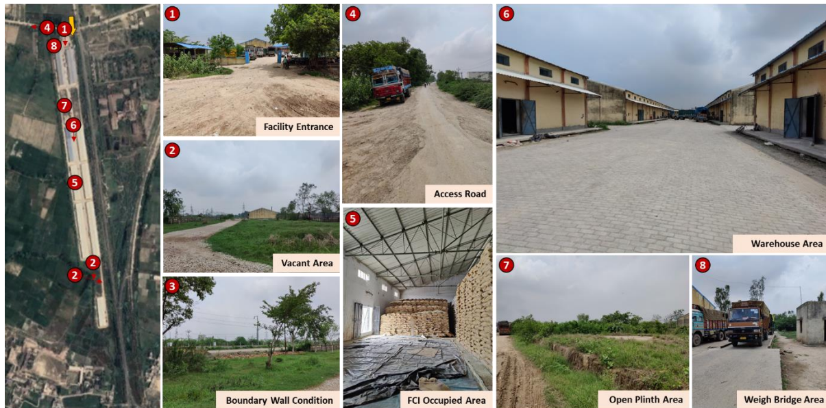
Figure : Shahganj Site Images